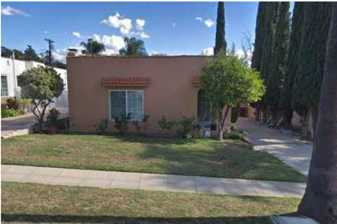
1354 LINDEN AVE