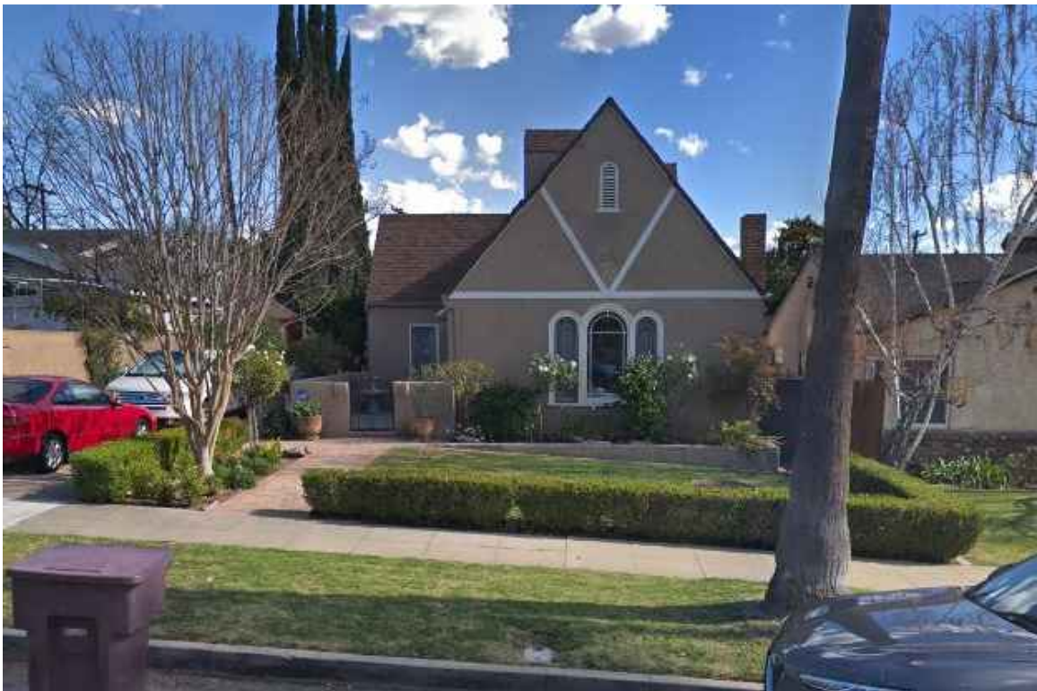
1920 BEL AIRE DR